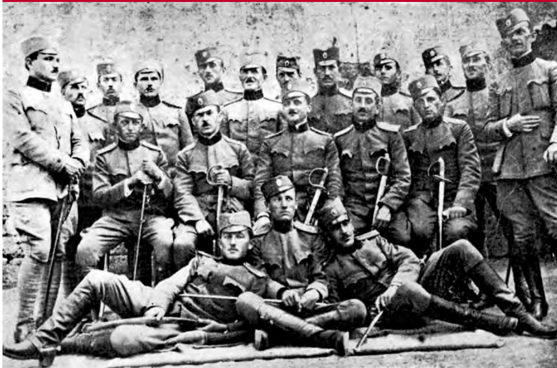
Značilne fotografije slovenskih dobrovoljcev srbske vojske 1914–18 Typical photos of Slovenian volunteers serving in the Serbian army in 1914–1918

ujetniška taborišča in agitiranje za vstop med srbske dobrovoljce, potovanje po Sibiriji in dolgotrajna vožnja z ladjo iz Vladivostoka do Dubrovnika, preboj solunske fronte in podobno). To so obdobja: